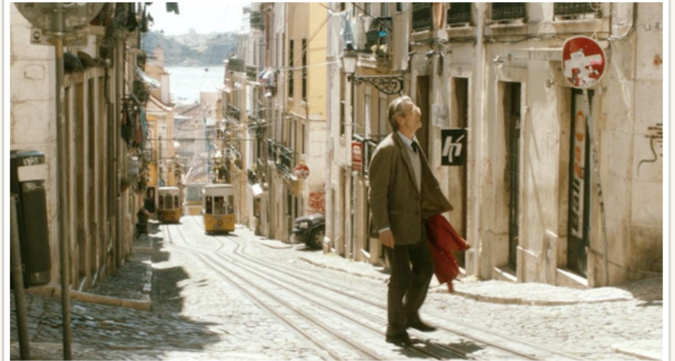
Night train to Lisbon 2013

Please send any expectations, suggestions or ideas to: