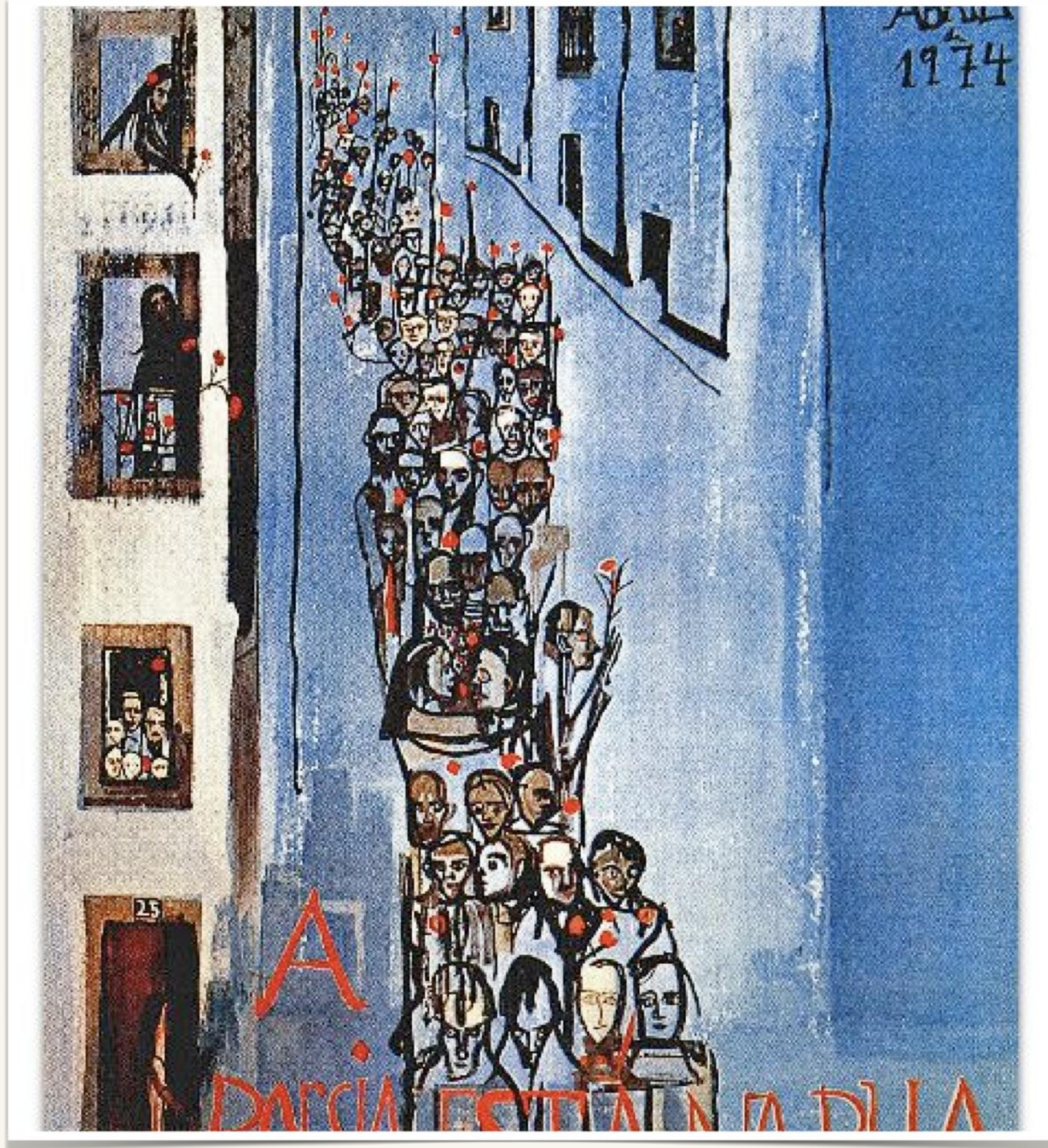
Cartaz A poesia esta na rua Maria Helena Vieira da Silva